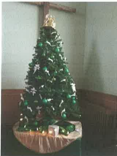
Our beautiful tree decorated in green balls and white doves