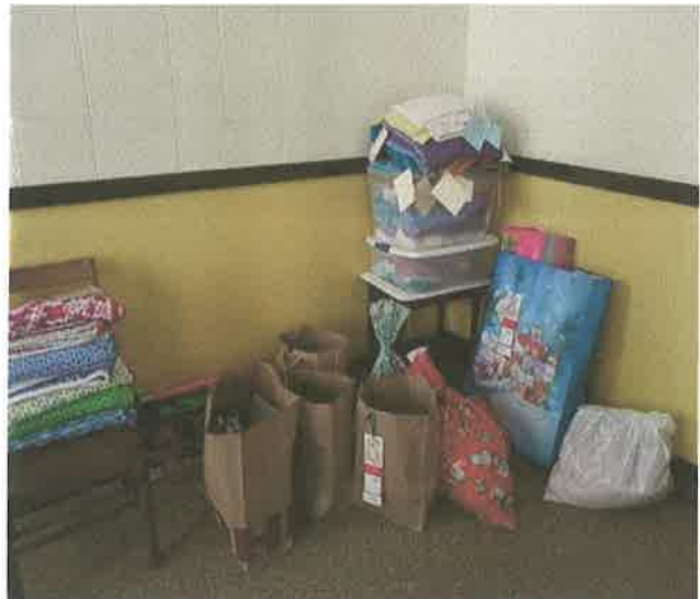
The angel tree and gifts to be distributed by Salvation Army