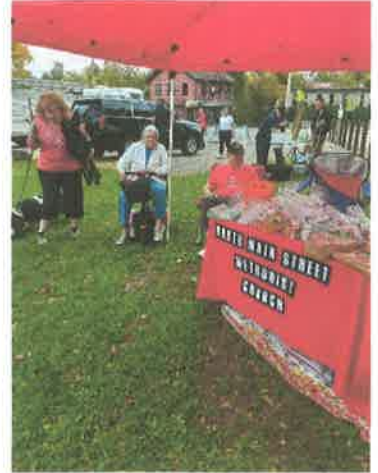
Scenes from the last Neighborhood Engagement Event at Trail Station Park