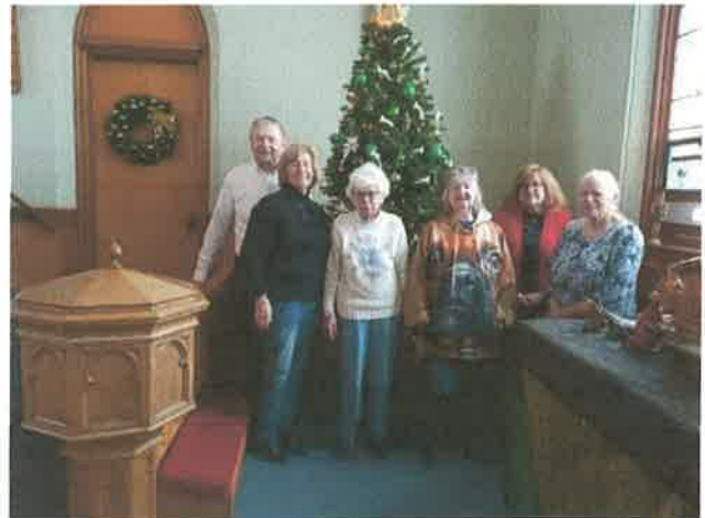
The church members who decorated the tree and windows