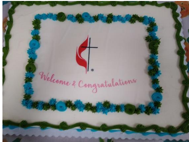
Cake served at reception to welcome the new members