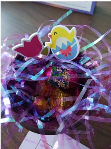
Easter Basket presented to Domestic Violence Program at Family Counseling Center