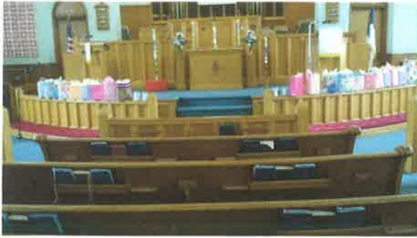
bags put together by church members to be donated to Domestic Violence team at Family Counseling Center and Haven of Hope